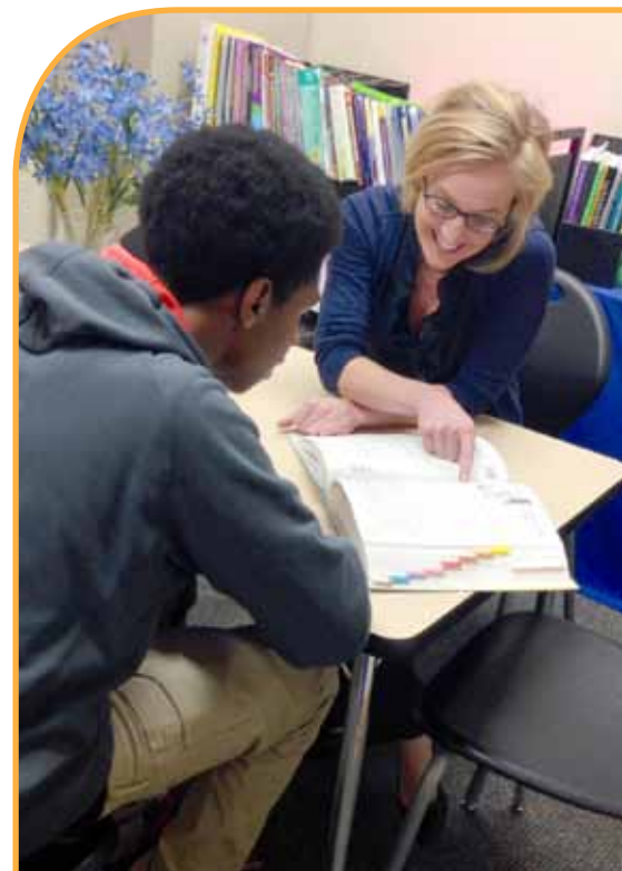
A Cincinnati Public School Liaison works with a KISR! student.

Legal Aid's Supporting School Success program is designed to give at-risk children the opportunity they deserve to attend school, benefit from needed supports, and make academic progress. School stability and success open critical doors for a child and can provide a means to overcome poverty barriers. Children in foster care and children caught up in the juvenile justice system have a greater rate of serious mental health issues and special education needs which put them at greater risk for problems in school. TeamChild serves youth caught up in the Hamilton County Juvenile Justice System, Kids in School Rule! (KISR!) focuses on youth in custody of the County Children's Services as does the Collaboration for Education Success of Children in Foster Care . An important component of these initiatives is integration of our advocacy with effective collaboration with schools and public systems to impact a student's educational outcomes.