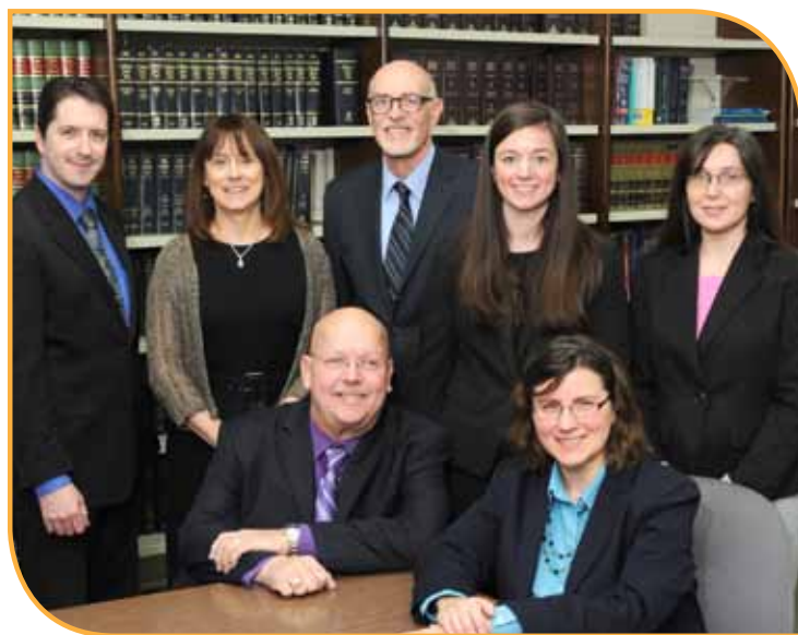
Pilot Family Law Mentoring class with Legal Aid Mentors

The VLP, co-founded in 1982 by the Legal Aid Society and the Cincinnati Bar Association, is now a multifaceted partnership with Legal Aid, county bar associations, corporate law departments, and private attorneys. The lawyers agree to take referrals from Legal Aid with assistance, as necessary, from Legal Aid attorneys. More than 700 private attorneys currently participate and, on average, handle 1,500 cases a year, expanding Legal Aid's ability to serve clients.